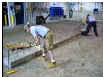
Pounding stakes to keep block in place