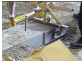
Adding the last block