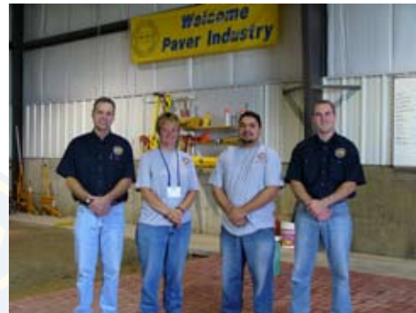
August 21, 2007 Hardscape Chemical Class

As always, if you have any questions, comments, or other School related issues, please do not hesitate to contact me. Thank you for this opportunity.