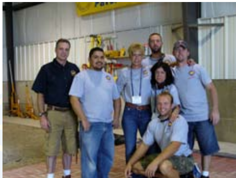
August 14, 2007 Foundation Skills Class