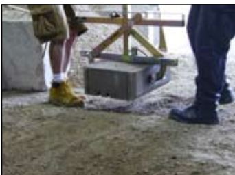
Getting ready to put block into place